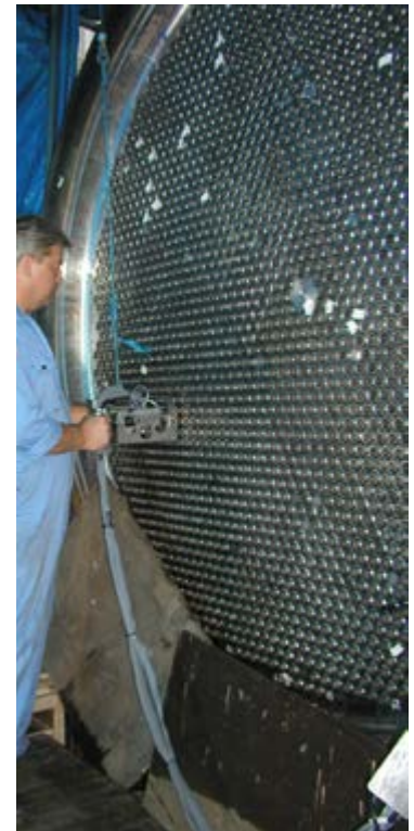
Tube-to-tube sheet inspection in a heat exchanger using the AHS-1 unit

For the heat exchange process to be effective, the tube material must provide good thermal conductivity. To minimize corrosion, the material needs to be compatible with both the shell-side and tube-side fluids under expected operating conditions (e.g., temperatures, pressures, pH). Materials that offer strength, thermal conductivity and corrosion resistance are metals including copper alloy, stainless steel, carbon steel, non-ferrous copper alloy, brass, nickel, titanium and special alloys such as Inconel® and Hastelloy®.